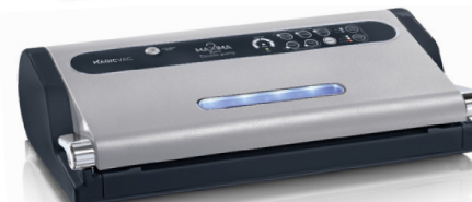
MAXIMA2 D96MAX Commercial