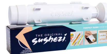
Make perfect sushi, anytime, everytime!