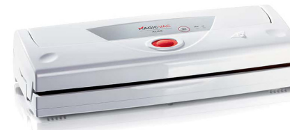
ALICE D80MV Domestic

MAGICVAC THE ORIGINAL VACUUM SEALING SYSTEM