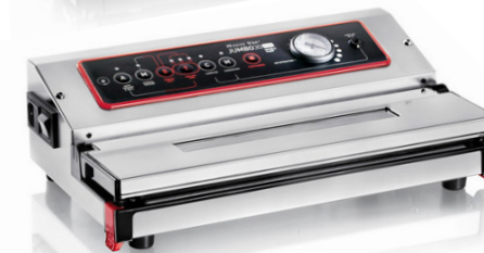
JUMBO EVO 30 D97EVO Commercial