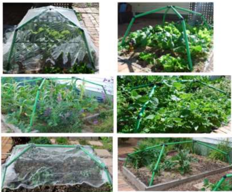
Green Harvest 3 in 1 kit in action