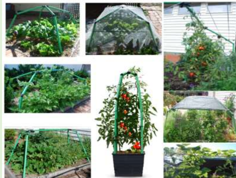
Green Harvest Ultimate Kit in action

The Green Harvest Ultimate Kit comes with